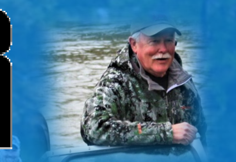
"All Rogue Jet boats are backed by our 100% Lifetime Hull Warranty."